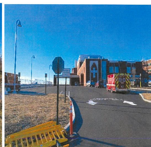
VIEW AS YOU TURN INTO OFF-LOAD AREA