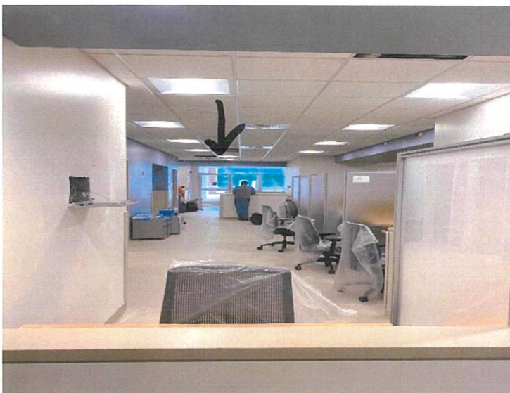
View looking at ambulance entry doors from back of ED