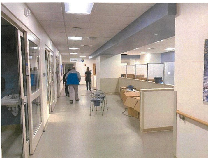
Standing to the left of the entry doors (#9, #10, #11, etc)