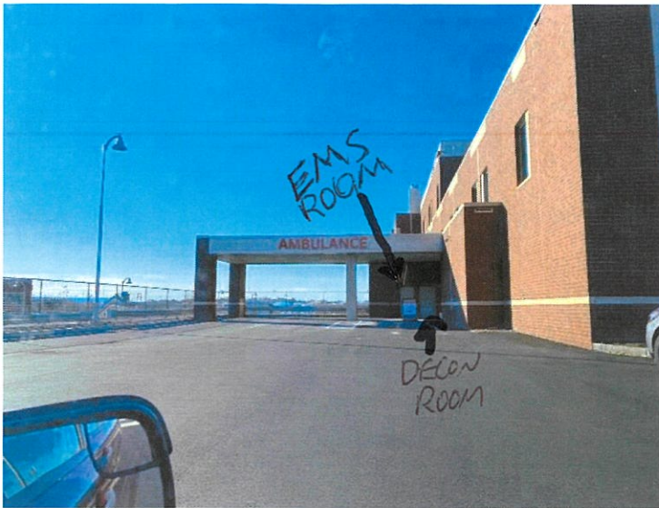
Back up under the canopy