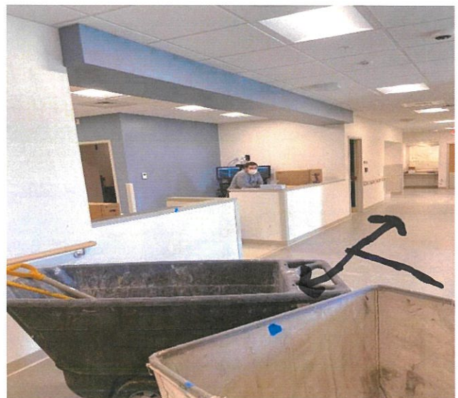
View standing to the left of the entry doors