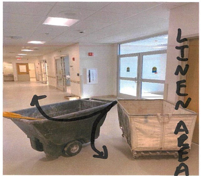
Entry located under the canopy