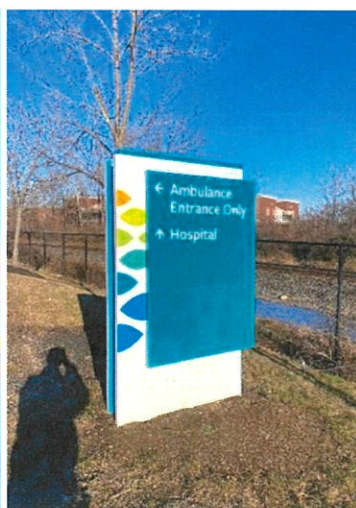
S26N @ AMBULANCE ENTRANCE